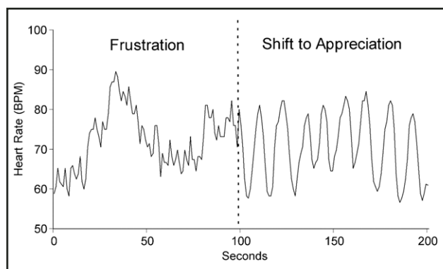
Figure 1. Shift to coherence. Real-time heart rate variability pattern of an individual using a HeartMath positive emotion refocusing technique (at the dotted line) to shift from a state of frustration to a feeling of appreciation, which is associated with psychophysiological coherence.